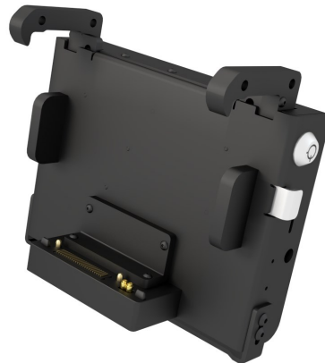
Unique space-saving and ergonomic design of PMT FZ-M1 / FZ-B2 vehicle dock (Front view)