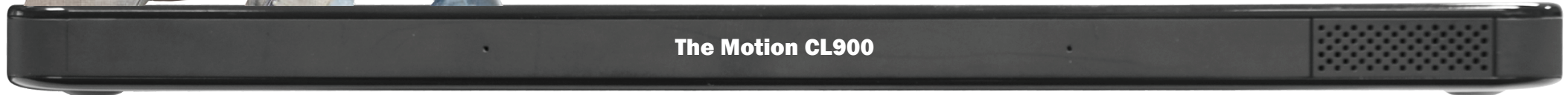
The Motion CL900